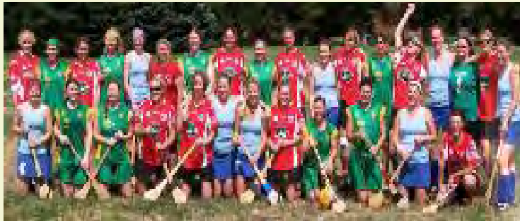
The Camogie teams of Denver in red, Milwaukee in blue and St. Louis in green at a tournament in Denver.