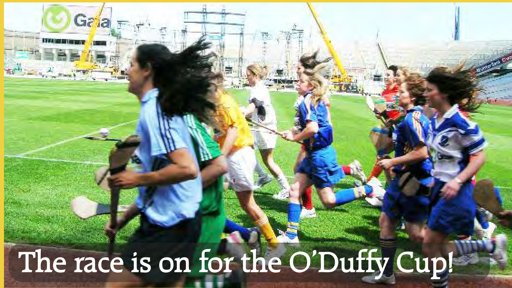
The race is on for the O'Duffy Cup!